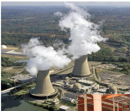
Top: Nuclear power plant cooled with brackish groundwater. Right: Brackish water desalination facility in Harlingen, Texas. The plant was built in 2007 and has a capacity of 2.25 million gallons per day.