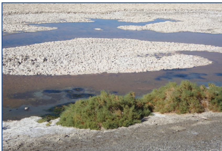
Groundwater in basin-fill aquifers of the Southwest often increases in dissolved-solids content as it travels along its flow path as a result of geochemical interactions with the aquifer matrix and through evaporative processes. At the end of its flow path, groundwater may be brackish or saline and discharges to the surface through springs such as this one in Death Valley.

Despite the need for alternative water sources and the potential availability of brackish groundwater, the most recent national map showing the distribution of mineralized groundwater was published in 1965. An updated evaluation is needed to take advantage of newer data that have been collected over the past 50 years. In addition, consistent information about chemical characteristics (such as major-ion concentrations) and hydrogeologic characteristics (such as aquifer material, depth, residence time, thickness, flow patterns, recharge rates, and hydraulic properties) of brackish groundwater has not been compiled at the national scale. Improved characterization is important for understanding and predicting occurrences in areas with few data and for assessing limitations imposed by different uses and (or) treatment options. This information is needed to understand the potential to expand development of the brackish groundwater resource and to provide reliable science for making policy decisions.