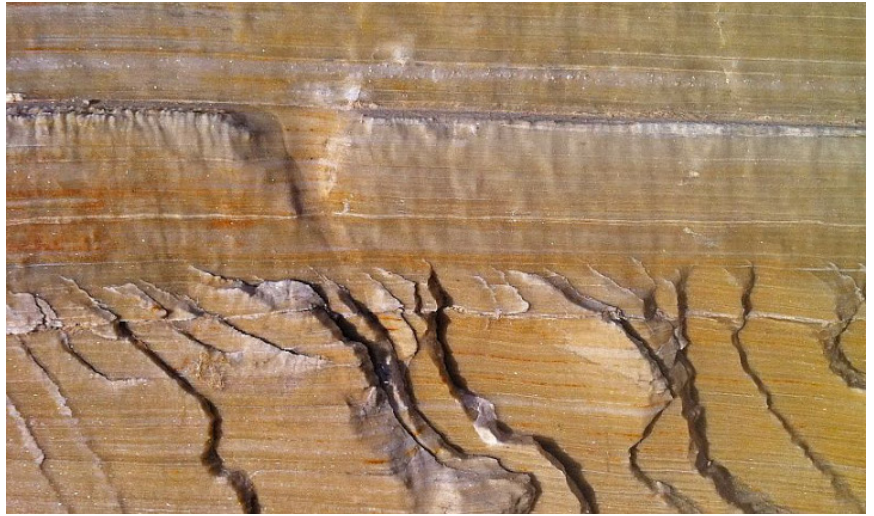
Salt deposits, such as halite or gypsum, are found in many sedimentary basins in the United States and are highly soluble. Other deposits are less soluble but can contribute dissolved solids when in contact with groundwater over longer periods of time.