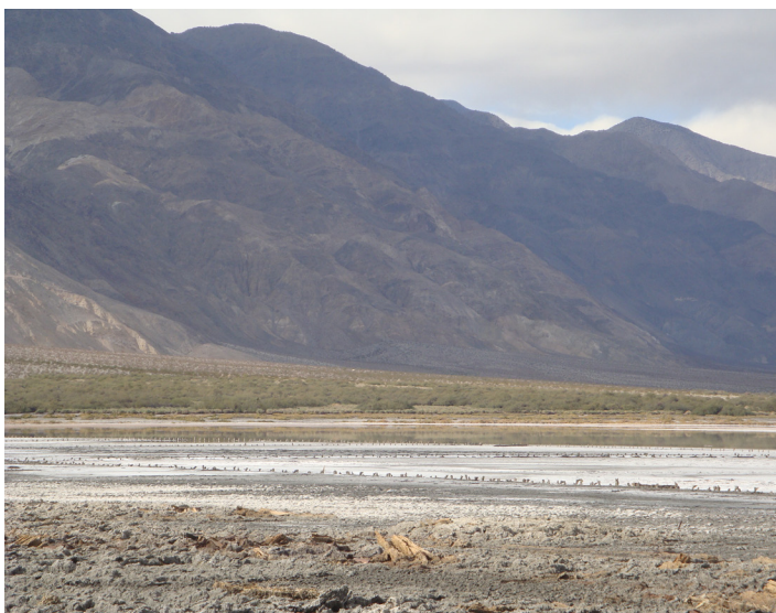
Groundwater discharge and rainfall-runoff collect and evaporate from this brackish playa lake in Saline Valley, CA.